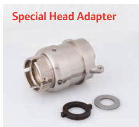
Special Head Adapter