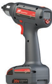
QX ETS (Ergonomic Tightening System)