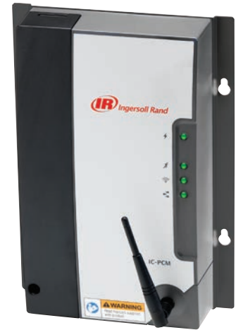
Process Communication Module