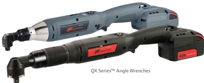
QX Series™ Angle Wrenches