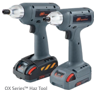
QX Series™ Haz Tool Class 1 Division 2 certified

The innovative QX Series™ is simple for anyone to use. It offers flexibility because of its feature-rich configurations, and can manage everything from data and fast programming to modifications on your line. The QX Series™ increases productivity and lowers costs — all at a price you can afford.