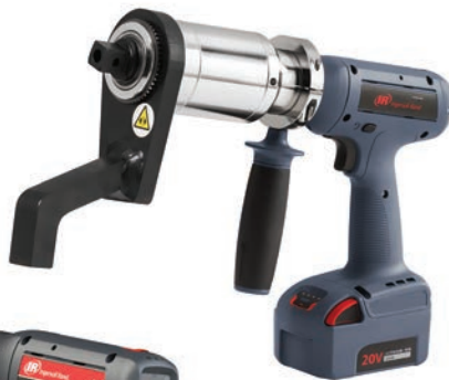
QX Series™ Multiplier 1,000 Nm Pistol