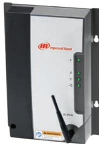
Process Communication Module